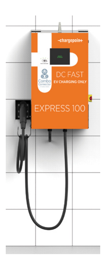
Express 100 with CCS1 Connector (shown with wall mount)