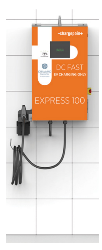
Express 100 with CHAdeMO Connector (shown with wall mount)