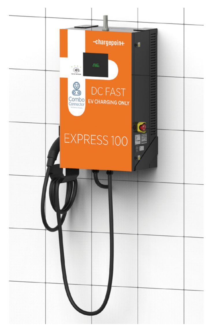
Express 100 with CCS1 Connector (shown with wall mount)