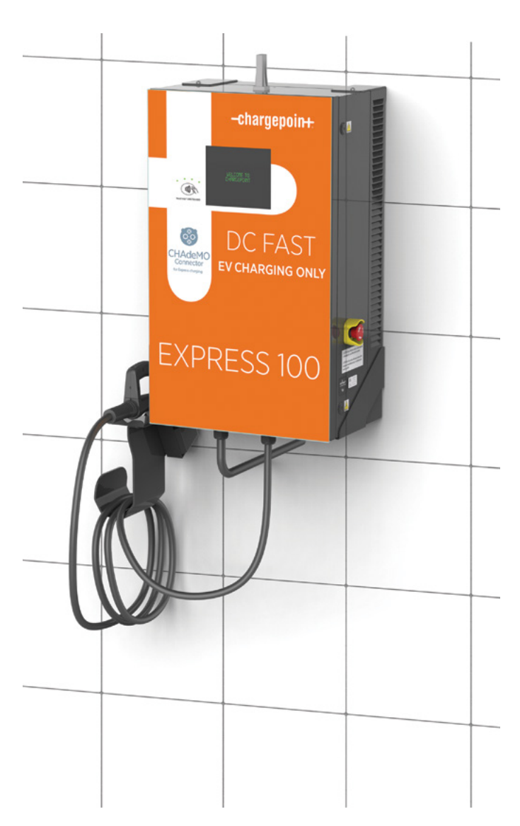
Express 100 with CHAdeMO Connector (shown with wall mount)